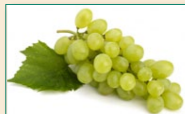
Thompson Seedless Grapes

G rapevines are growing over more and more of California as farmers add to their grape acreage, according to a report from the National Agricultural Statistics Service of the USDA. California’s 2013 grape acreage totaled 878,000 acres, up from 847,000 acres the year before. Of the total grape acreage last year, 820,000 were bearing while 58,000 were non-bearing. The wine-type grape acreage is estimated at 570,000 acres. Of the total, 525,000 acres were bearing and 45,000 were non-bearing. The leading wine-type varieties continued to be Chardonnay and Cabernet Sauvignon. Table-type grape acreage totaled 105,000 acres, up 7.1 percent from the 98,000 acres in 2012. Acreage of raisin-type grapes totaled 203,000 acres, and Thompson Seedless continued to be the leading raisin-type variety, utilized for raisins, fresh market, concentrate and wine.