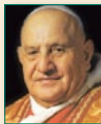
— Pope John XXIII

“Men are like wine — some turn to vinegar, but the best improve with age.”